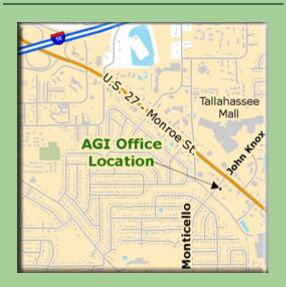
Contact us to find out how we can add value to your projects and deliverables in a costeffective and time-efficient manner.

We are intent on promoting stewardship of natural resources and streamlining business processes through the development and application of geographic information systems.