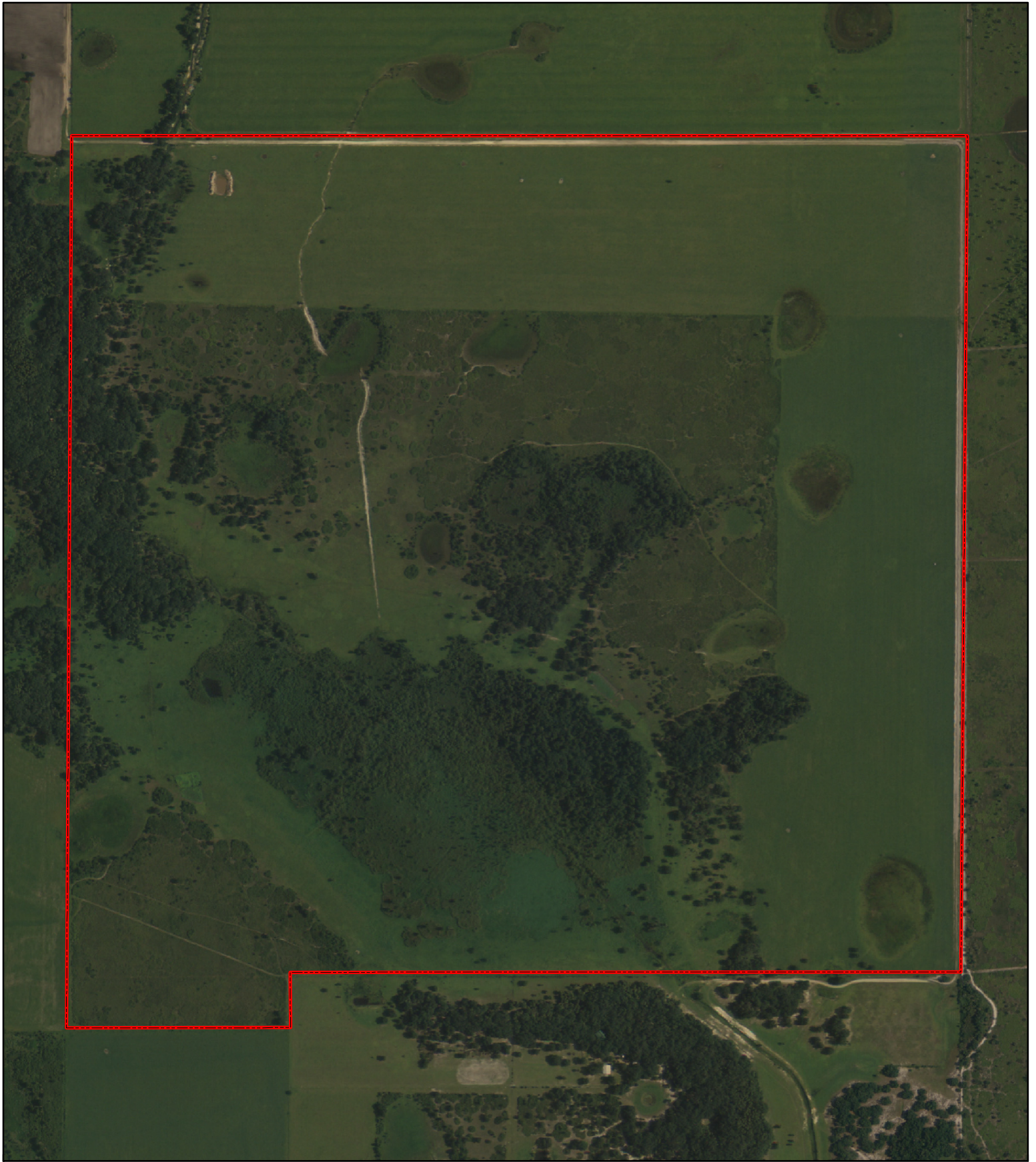
Figure 3f Historic Aerial Map

Wilma Overstreet Trust, Osceola County, FL 2007 Natural Color Orthophotos, (0.5-m) resolution