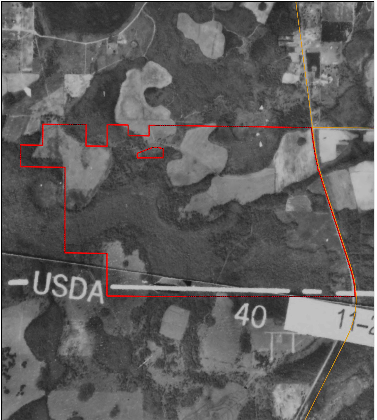
Figure 3e Historic Aerial Map