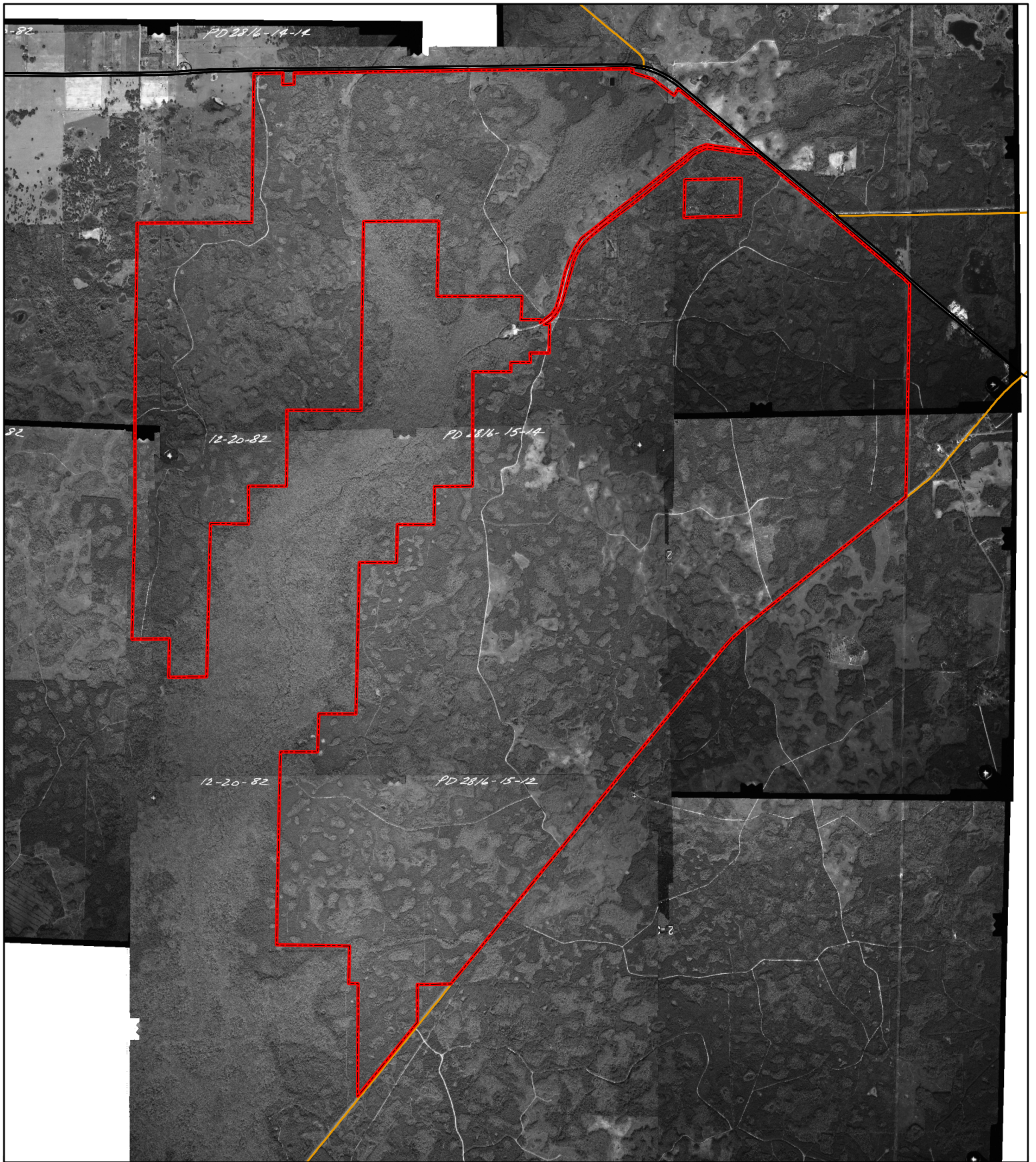
Figure 3d Historic Aerial Map