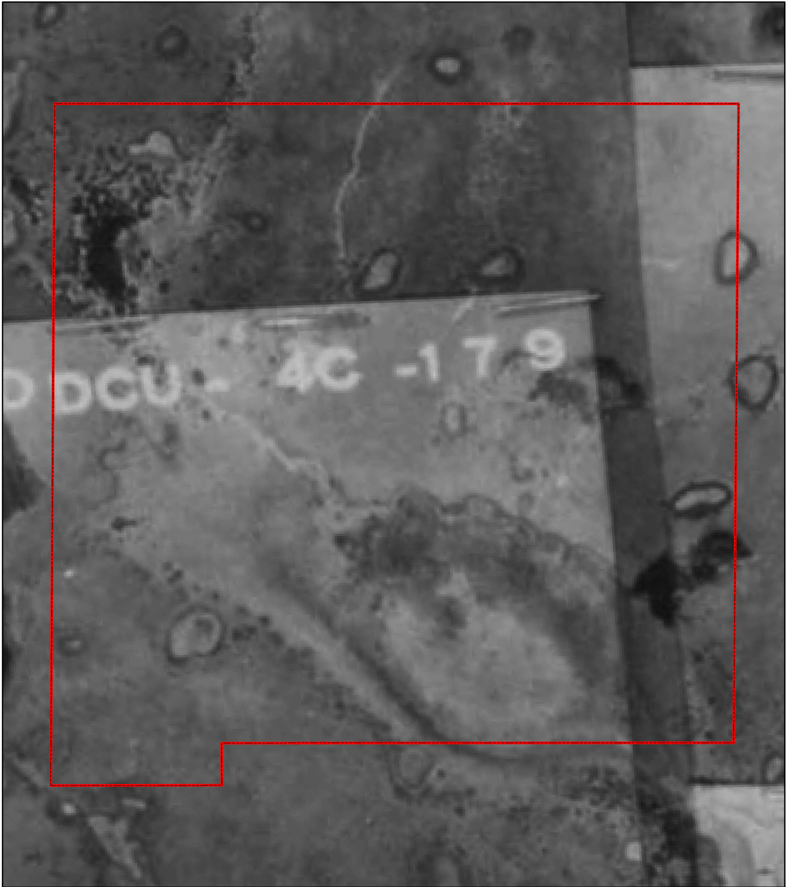
Figure 3a Historic Aerial Map