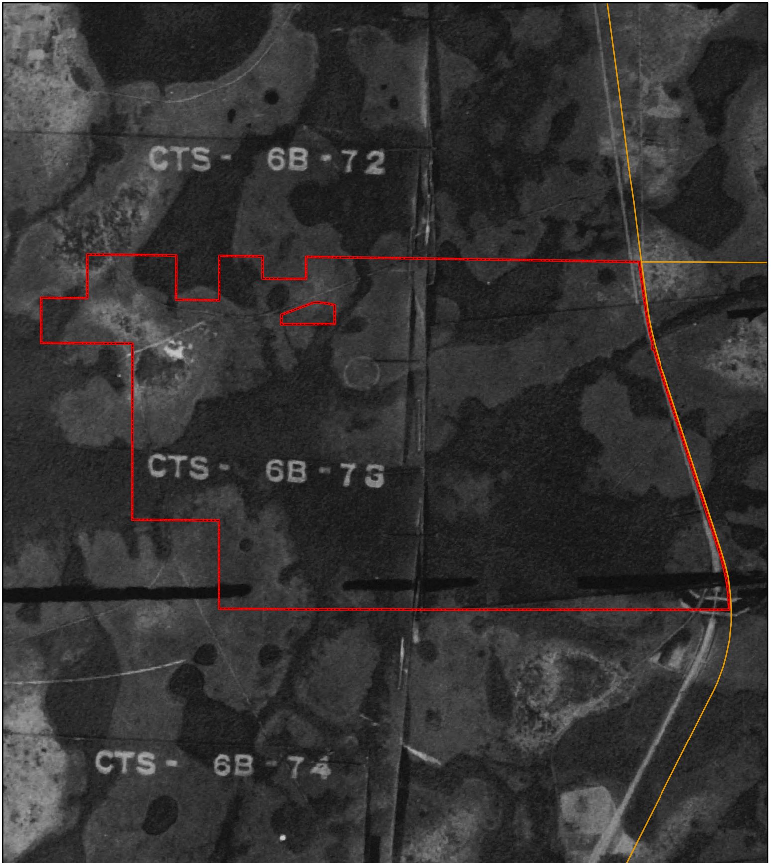
Figure 3a Historic Aerial Map